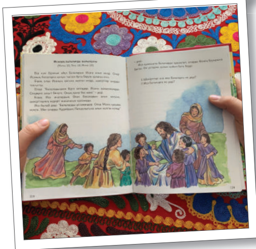
Kazakh A Child’s Garden of Bible Stories